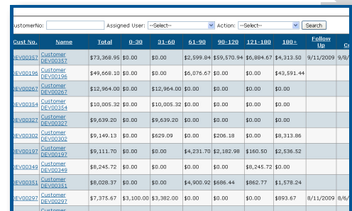
giving you an outlook of your receivables and their status...